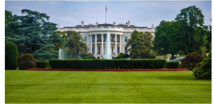
Executive Order on “Promoting Competition in the American Economy”

Help ensure that the patent system, while incentivizing innovation, does not also unjustifiably delay generic drug and biosimilar competition beyond that reasonably contemplated by applicable law, not later than 45 days after the date of this order, through the Commissioner of Food and Drugs, write a letter to the Under Secretary of Commerce for Intellectual Property and Director of the United States Patent and Trademark Office enumerating and describing any relevant concerns of the FDA.